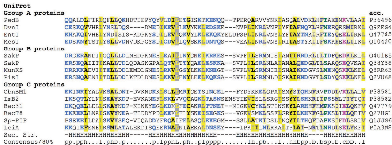
Figure 2 Alignment of representative immunity proteins. Multiple sequence alignment of representative immunity proteins from groups A, B and C colored using CHROMA software (Goodstadt and Ponting 2001).

Sequence analysis reveals that Sp-PIP belongs to the now expanded Pfam family of immunity proteins EntA_Immun that also includes pediocin-like immunity proteins from groups A, B and C as detailed above, thus confirming its evolutionary link to known bacteriocin immunity proteins. A search for other immunity proteins of a similar nature in the S. pyogenes genome identified another gene locus encoding a protein matching the